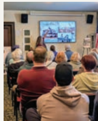
GUESTS EXPLORING THE GRANT HOUSE (LEFT) AND LISTENING TO A PRESENTATION AT THE HOWARD HOUSE (RIGHT) DURING THE THREE-HOUSE SECRET SPACES TOUR ON MAY 3.