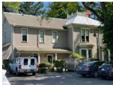
WEST SIDE ROOFING