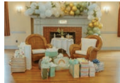
BABY SHOWER AT THE RED CROSS BUILDING