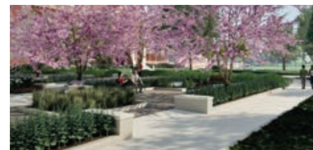
SACRED HEART PLAZA AT ED LYNCH SQUARE RENDERING - WALKWAY LOOKING EAST