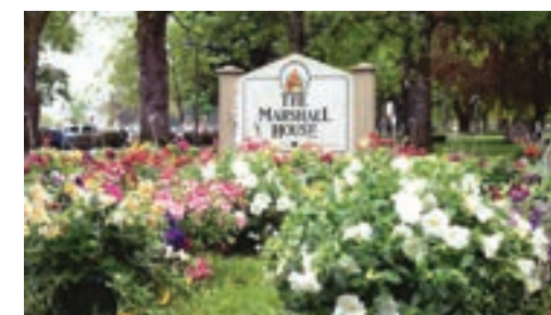
GERANIUM SALE AT THE MARSHALL HOUSE