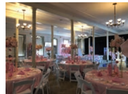
QUINCEAÑERA IN THE PROVIDENCE ACADEMY BALLROOM