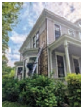
WEST SIDE REPAIRS

This spring, we installed a new roof and made some siding repairs at the General O.O. Howard House. This work was funded partially by a Heritage Capital Projects program administered by